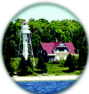
Plum Island Range Light (#6)

Compliments of the DOOR COUNTY CHAMBER OF COMMERCE VISITOR & CONVENTION BUREAU ® www.DoorCounty.com