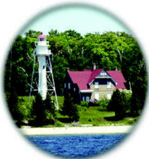
Plum Island Range Light (#6)

Compliments of the DOOR COUNTY CHAMBER OF COMMERCE VISITOR & CONVENTION BUREAU ® www.DoorCounty.com