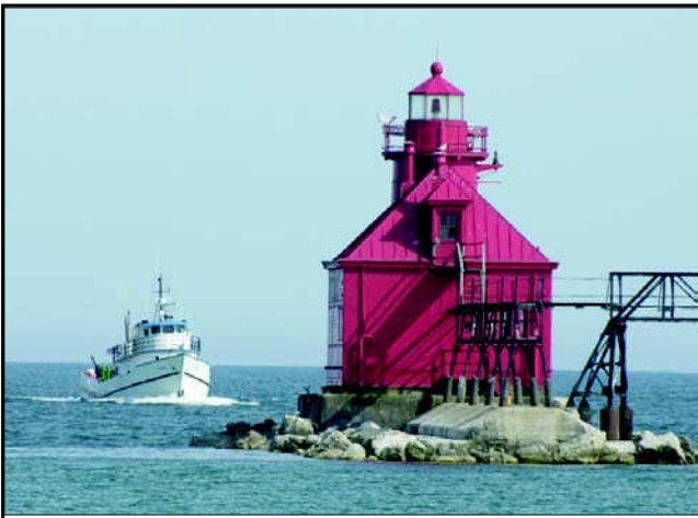
Canal Station Pierhead Light (#3 on map)