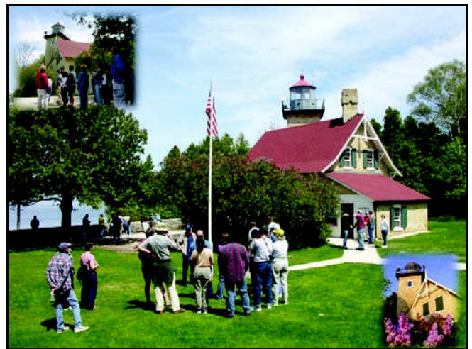
Eagle Bluff Lighthouse (#2 on map)

Phone (920) 847-2554 (Coast Guard Station on Washington Island, June - mid-September).