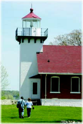
Sherwood Point Lighthouse (#4)