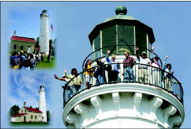
Tower is only open to public during Lighthouse Walk weekend in May

Location: Take County Q at the North edge of Baileys Harbor to Cana Island Rd. two and a half miles (Note: Sharp Right Turn on Cana Island Rd). Roadside parking is very limited. Please respect private property when parking. The island is not accessible by car.