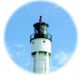
Canal Station Lighthouse (#3)