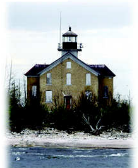
Pilot Island Lighthouse (#9)